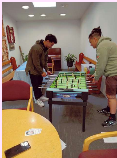
.... actually being used!