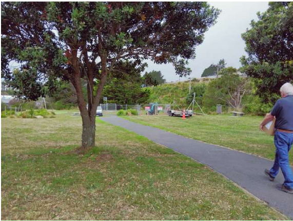
Wall Park In the beginning.....