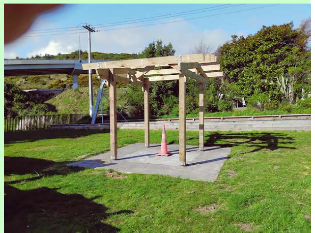
Looking lonely without the BBQ