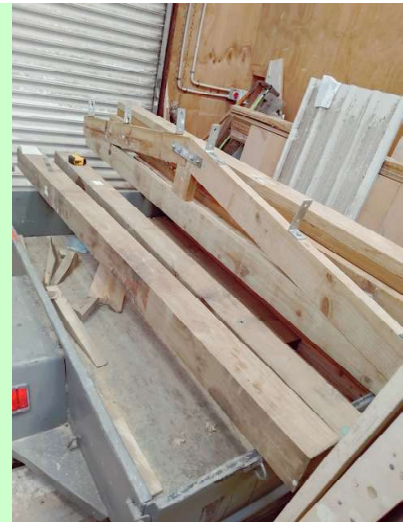
.... not sure how well tho'