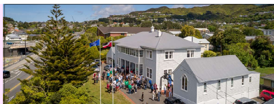
Challenge 2000 in Johnsonville