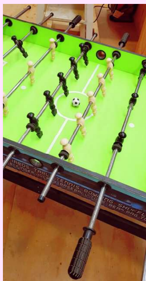
Let the game begin.....