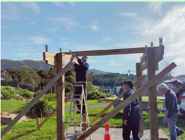
Eventually it got erected on site