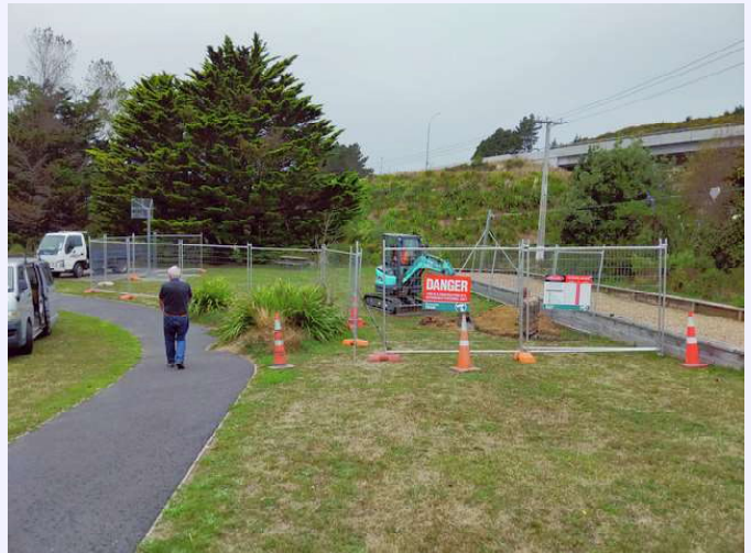
An idea of the size of the site for BBQ