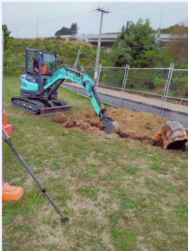
.....digging for underground cables.....??