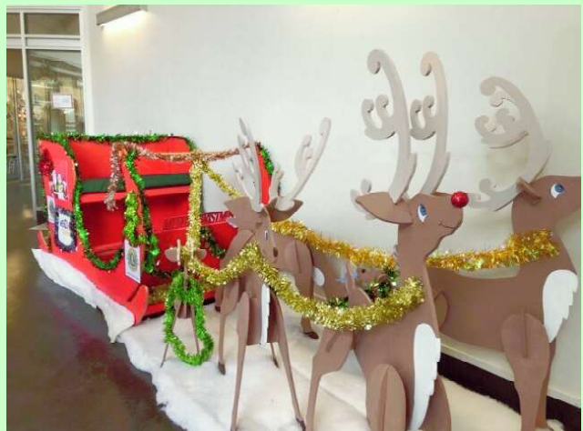
Reindeer, on duty at Tawa Christmas Parade on streets of Tawa