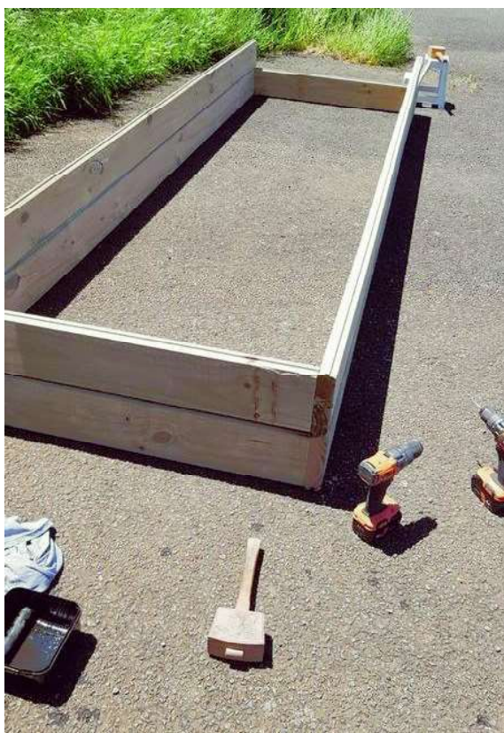
Linden Community Garden, run by the Vulnerable Support Charitable Trust. Building a third garden bed. The Shed did it.

To get an idea what this organisation is about, you will be surprised, please go to :