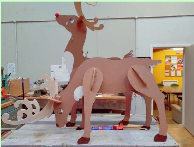
Reindeer, ready for duty

Faith can be contacted on: 027 322 1372 John H on: 021 100 2069