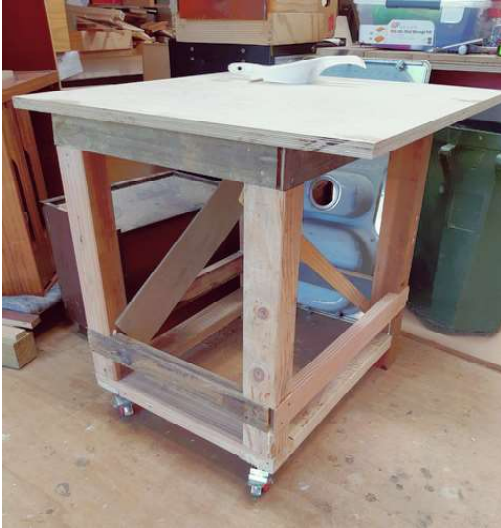
Peter Nalder is making great strides on the “ new table” for our new Thicknesser

Below: Our new thicknesser waiting patiently for Peter’s new mounting table