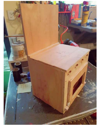
I was ready to give up at this stage.....