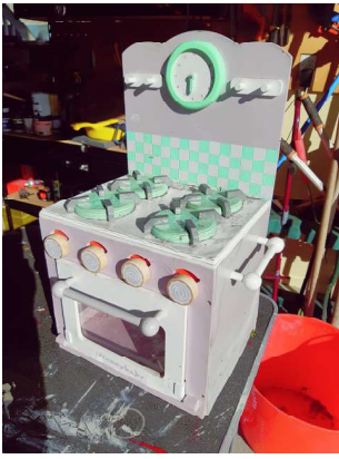
Original, it got wet and was breaking up

For those members that have watched me fumble my way through making a replacment toy cooker for the Plunket, thank you for all the advice and encouragement. It was gratefully received by Plunket