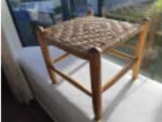
The finished stool

The crucial clamping together of the spindles and legs - this this was “hold your breath” stuff!