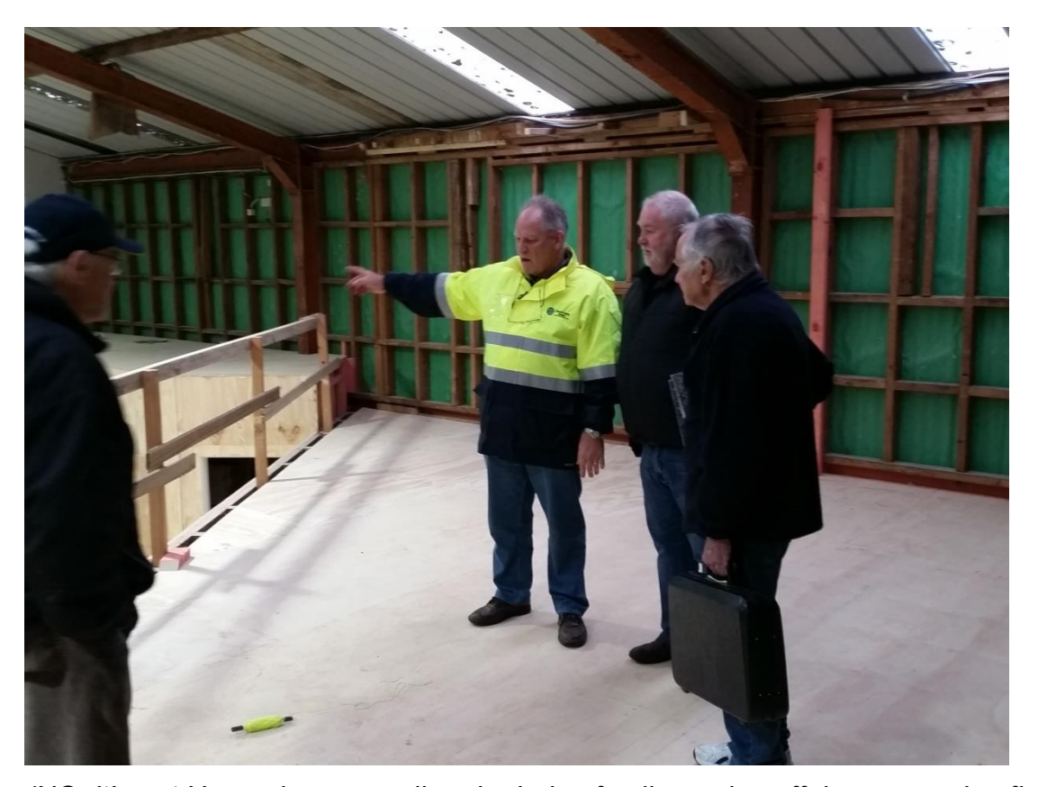
(NO, it's not Howard commanding the bale of yellow twine off the mezzanine floor to join the other tools)

Some of the MenZshed executives on the mezzanine floor looking down onto tool storage area