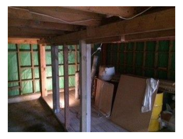
Under the mezzanine floor, the space designated as the machine room.