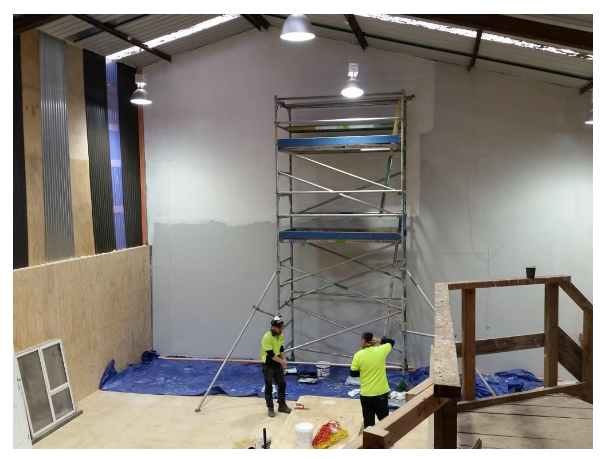
Back wall of shed plastered and painted