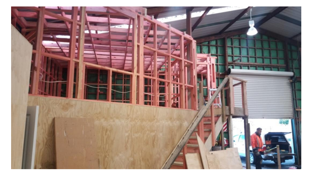
The mezzanine floor framed and ready for insulation and walls