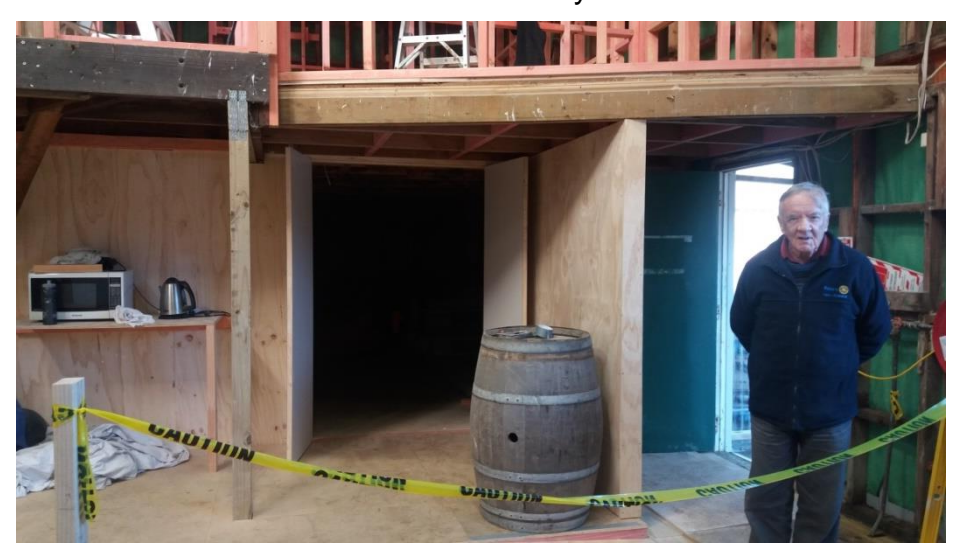
Doug at the entrance to the machine room, under the mezzanine room Even the entrance now has a weather awning