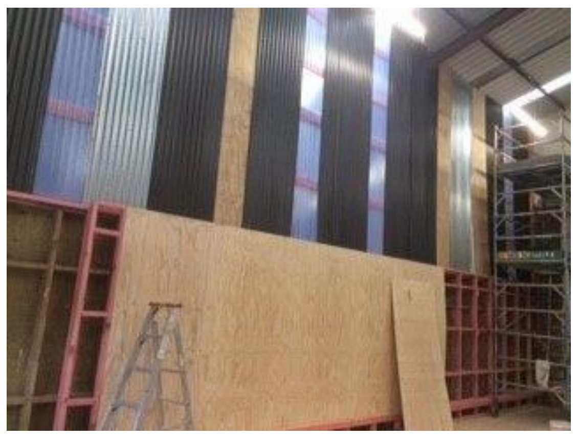
The shed's new internal South wall lined with steel and wooden framing. This will reduce the dust from the adjacent WCC earth storage facility and will prevent birds from nesting and soiling our shed.