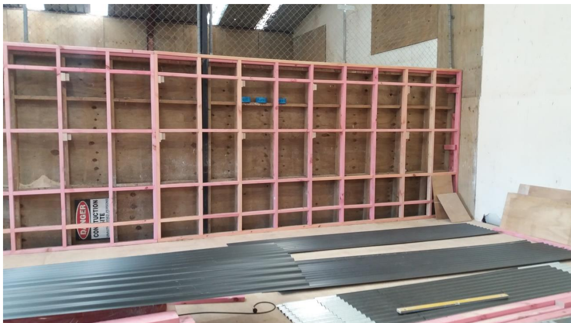
South wall framed, awaiting ply panelling

The South wall is having steel panels erected to the ceiling. This will minimise dust from the adjacent room and prevent birds from nesting and soiling the newly fitted floor and fittings.